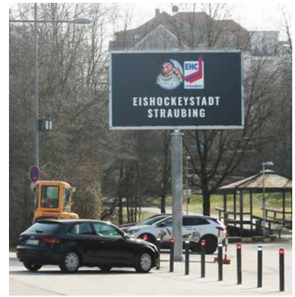
Straubing Tigers, Straubing / Germany