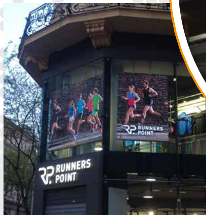
Runners Point, Vienna / Austria