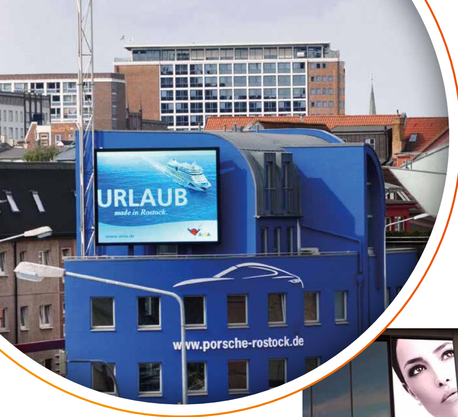
Advertising display, Rostock / Germany