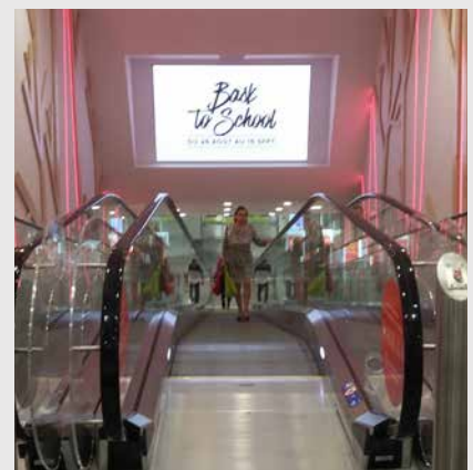
IKEA, Bayonne / France