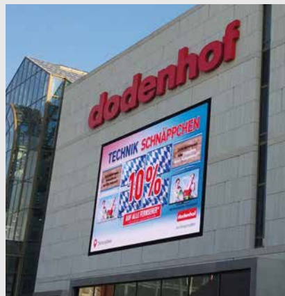
Shopping Center dodenhof, Posthausen / Germany