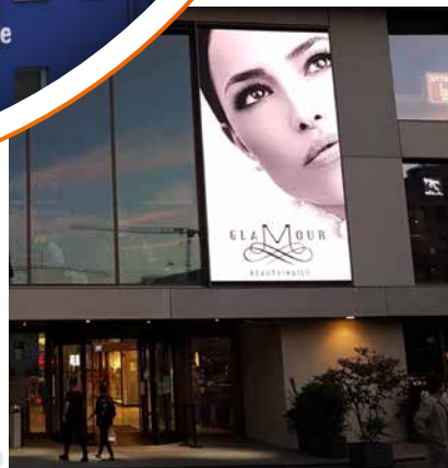
Archhöfe, Winterthur / Switzerland