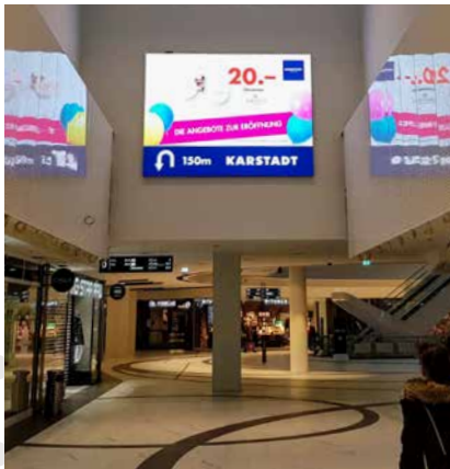
Gropius Passagen, Berlin / Germany