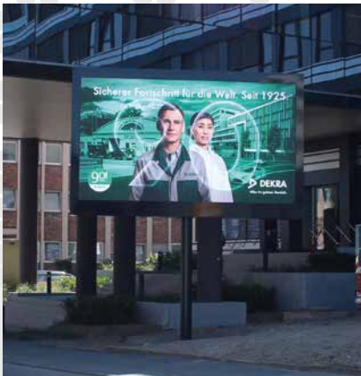
DEKRA, Stuttgart / Germany