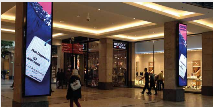
Centr0, Oberhausen / Germany