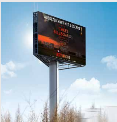
AdverTower, Linkenbach / Germany