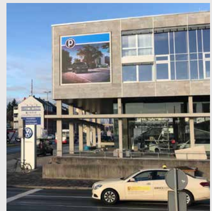
Pillenstein, Fürth / Germany