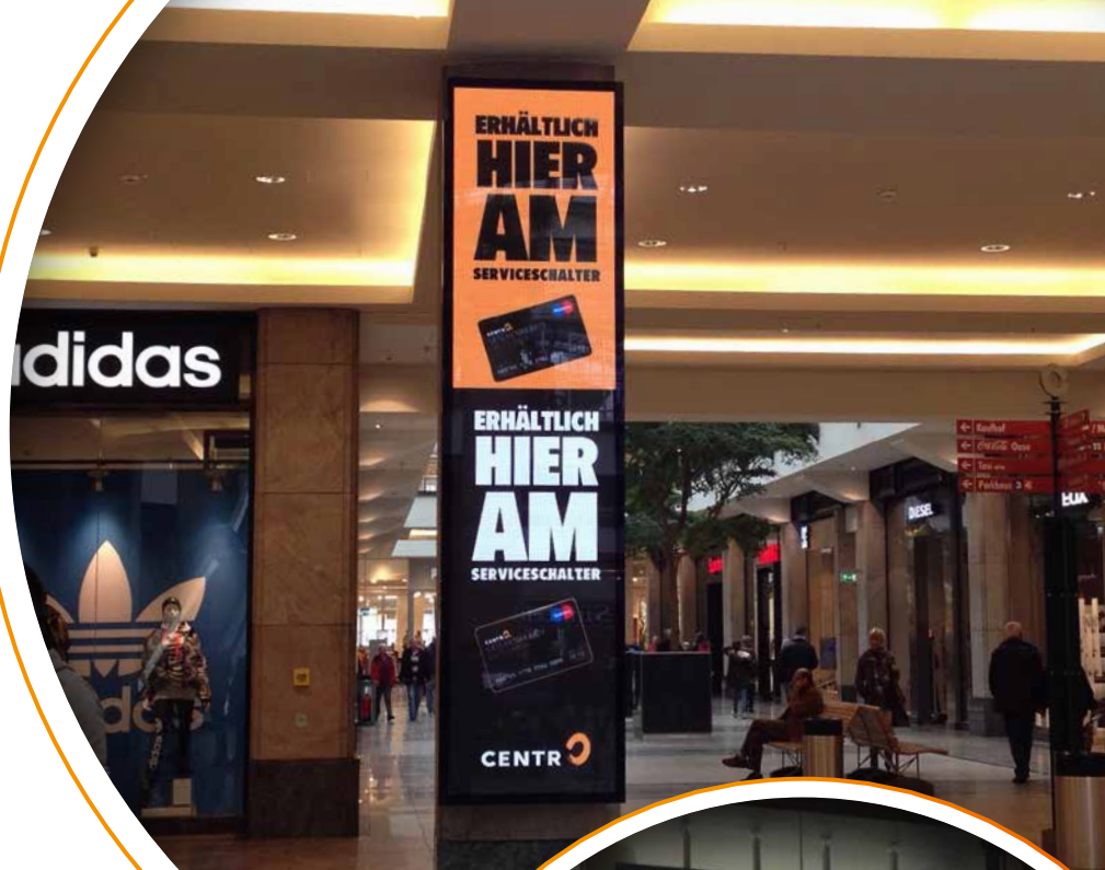
Centr0, Oberhausen / Germany