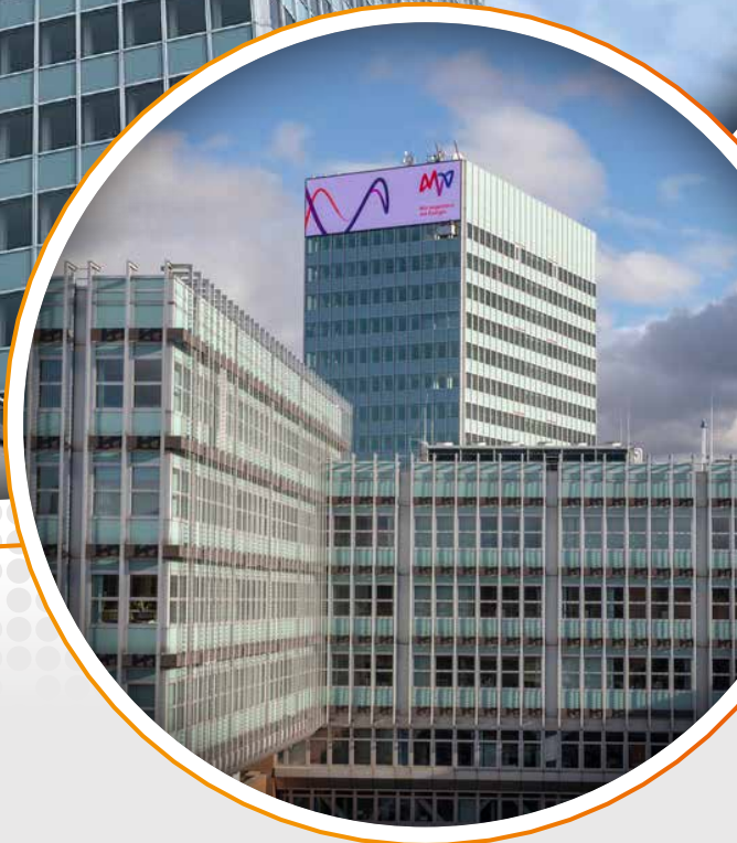
MWV Energie AG, Mannheim / Germany