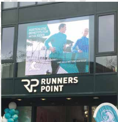
Runners Point Ku'damm, Berlin / Germany