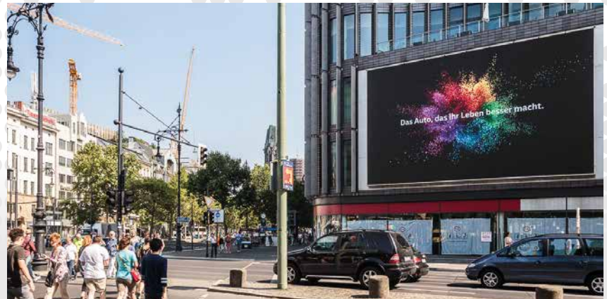
Kurfürstendamm, Berlin / Germany