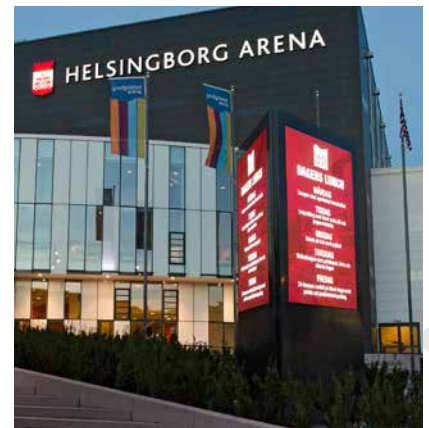
Helsingborg Arena, Helsingborg / Sweden